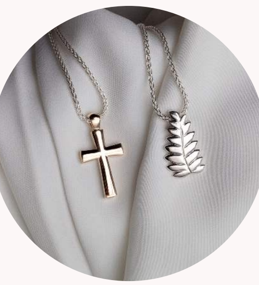
Heart in Hand