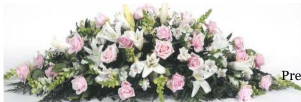
Premium Coloured Casket Spray 1.5 metres $350