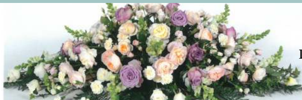
David Austin Cottage Garden Casket Spray 1.2 metres $360