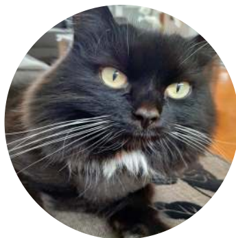
Bella, the Fountain's Cat