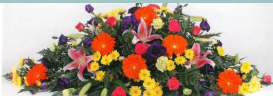
Bright & Cheerful Casket Spray 1.2 metres $255