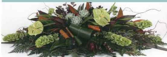
Native Casket Spray 1.2 metres $275