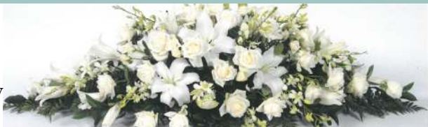
Premium White Casket Spray 1.5 metres $395