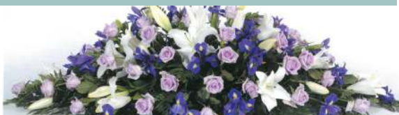
Sweet Peace Casket Spray 1.5 metres $390